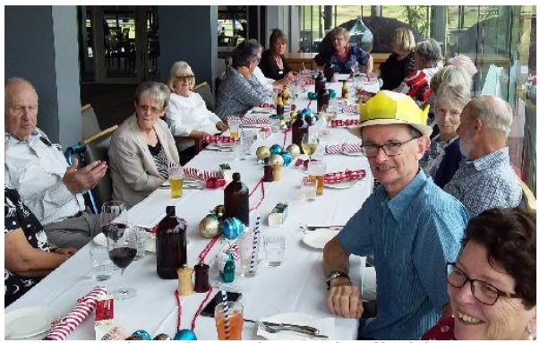
XMAS at 13th Beach - Residents and staff celebrating their first Christmas together.