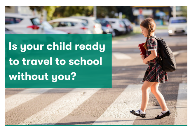
Learn together at Neighbourhood Watch 4 Kids