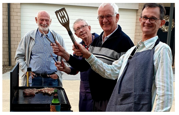
NYD BBQ - The men were on cooking duty for the New Years residents BBQ